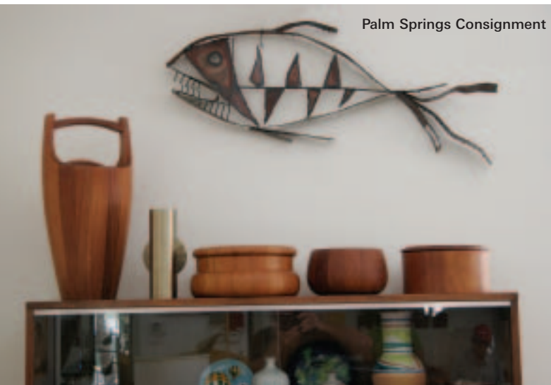
Palm Springs Consignment