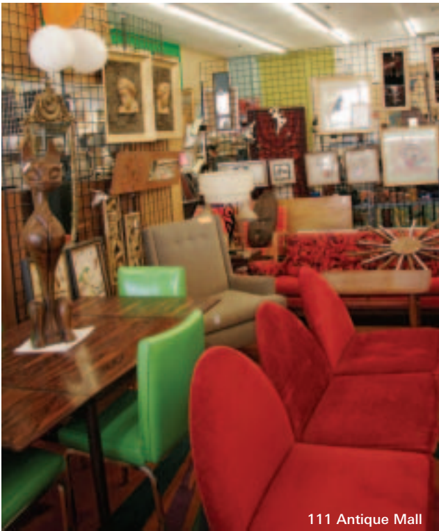
111 Antique Mall

laughing now. The duo has what Connell calls “two supermarkets of mid-century Modern.” With more than 23,000 square feet of space and nearly 100 dealers between them, you could easily spend the entire morning at either of these two malls. If you can’t find something in one of the 111 Antique Malls, you’re simply not trying. The greater challenge is showing restraint among the sea of vintage pottery, glass, lighting, furniture, and art – from kitsch to high-end, from a $12 ashtray to a $2,500 sectional. Hall and Connell say right now their younger customers are clamoring for ‘70s furniture – think chrome, Lucite, and mirror-covered pieces.